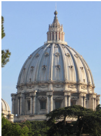
The Dome of St. Peter's Basilica

JUBILEE YEAR TUESDAY, JUNE 17 TO FRIDAY, 20, 2025 ROME, ITALY